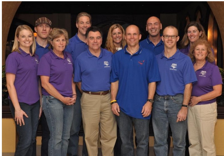
2010 Southwest Region Council

Welcome to the Southwest Region's quarterly newsletter! 2010 is full of exciting opportunities for coaches, officials, race directors, clubs and events for aspiring, novice and veteran multisport athletes. Grab your favorite pre-workout snack or beverage and read up on the latest happenings in California, Arizona and Nevada, then get out there and swim, bike and run!