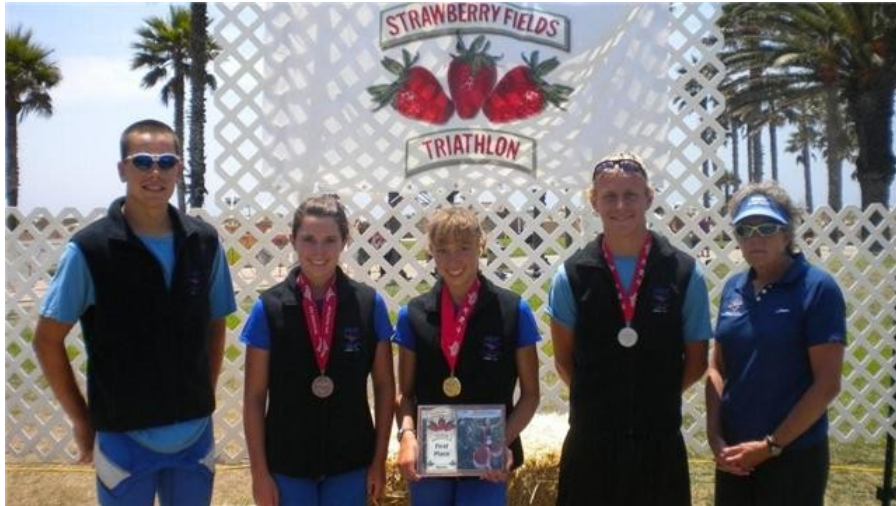
Strawberry Fields Triathlon - 2009